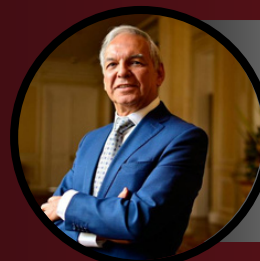
Ricardo Bonilla González Minister of Finance and Public Credit of Colombia