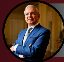
Ricardo Bonilla González Minister of Finance and Public Credit of Colombia